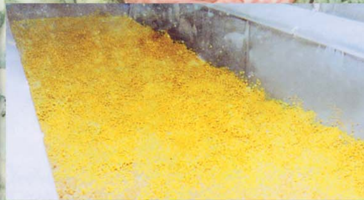
Cut Corn on Fluidization Freeze Section