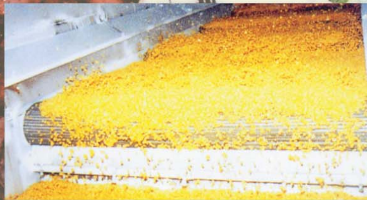
Cut Corn on Crust Frozen Precool Section