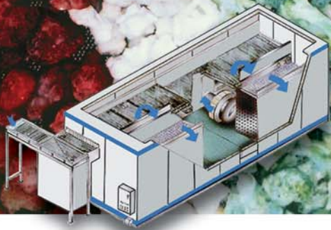
I.Q.F. PACKAGED FLUIDIZED TUNNEL FREEZER