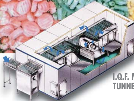
I.Q.F. MODULAR FLUIDIZED TUNNEL FREEZER